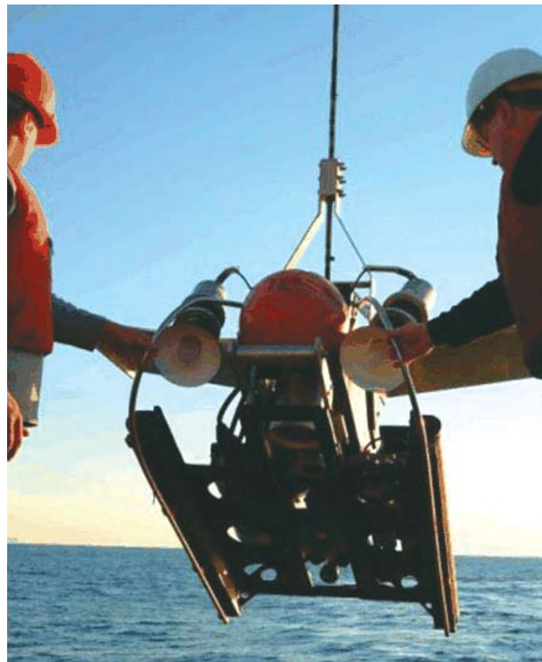
Canadian Department of Fisheries and Oceans

But from a strategic point of view, from this country's point of view—because