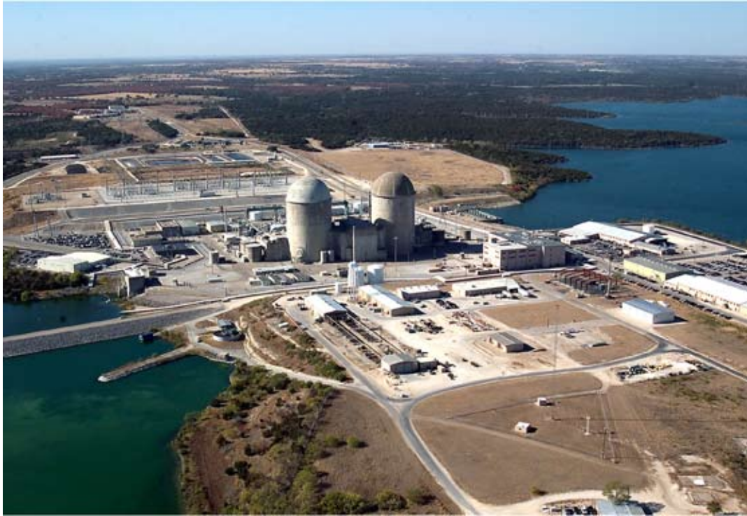
The Comanche Peak nuclear plant site in Texas, has two reactors totalling 2,500 megawatts, sited on 4,000 acres that include a cooling pond and recreation area. The nominally equivalent output in wind turbines would occupy 229 square miles, about three times the size of the metropolitan Washington, D.C. area.