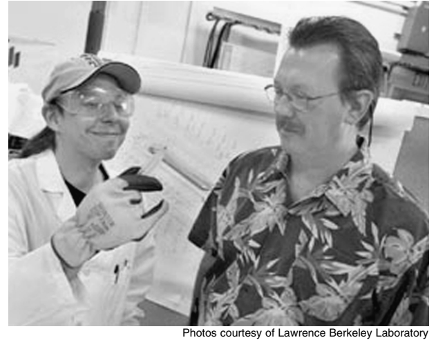
(right) with a student

Question: Certainly that idea of progress was a key characteristic of the Franklin