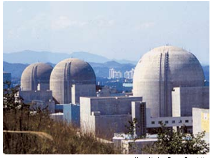
Korea Nuclear Energy Foundation

Question: Many countries from the developing world—Africa, Asia, the