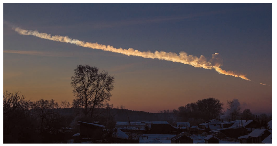
The meteor strike at Chelyabinsk, Feb 15, 2013.

From orbit, and now, from stunning photos taken by Curiosity, it is clear that Mount Sharp has a story to tell. The base of the mountain will contain the oldest excavated material in the crater, and its sedementary layers, laid down through successive periods of flowing water, should reveal more of the chemical, geologic, hydrologic, and atmospheric history there. If Curiosity is able to climb up the side of Mount Sharp, eons of time of Mars' history will be revealed.