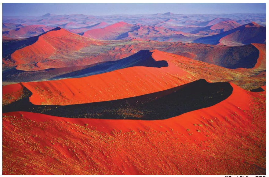
Dune Sea in the Namib Desert, Namibia.

One such example is in the film called "Rare Earth." In order to present the global warming argument, the narrator develops the relationship of the Earth's core to the atmosphere and shows how that affects carbon dioxide. The Earth's atmosphere is regulated by the magnetic field generated by the Earth's iron core. Over time, molten magma rises from the Earth's core and moves the Earth's plates, narrator Stewart says: "Where the plates collide, volcanic eruptions are caused that release carbon dioxide into the atmosphere. Today we think of carbon dioxide as a dangerous greenhouse gas that leads to global warming," Stewart says, "but throughout Earth's long history, carbon dioxide has played a vital role in keeping the Earth at the right temperature for com-