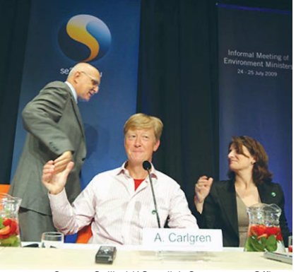
Gunnar Seijbold/ Swedish Government Offices

Swedish environment minister Andreas Carlgren at the closing of the hedonistic EU environment ministers meeting in Aare, Sweden.