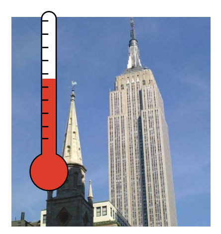
The quiet Sun gave New York a cooler summer.

Lord Stern attacked the notion of developing nuclear power in an interview with the Swedish daily Svenska Dagbladet , saying "We need all the CO<sub>2</sub>-free energy we can get. But new nuclear power cannot deliver any electricity until after 2020, and I hope renewable energy sources will have developed strongly until then."