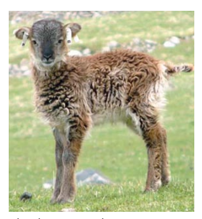
Shrinking? Soay sheep are enjoying the benefits of a slightly warmer climate in northern Scotland.