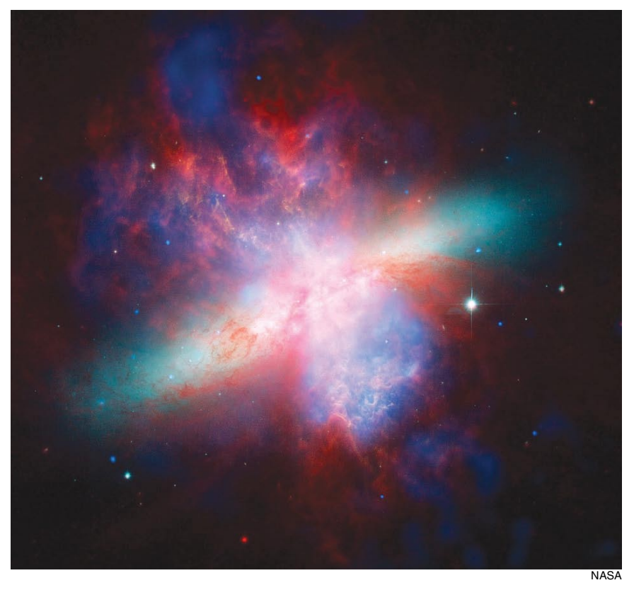
A mosaic image from the Hubble and Spitzer telescopes and the Chandra Observatory of the starburst galaxy, Messier 82 (M82). The galaxy has a bright blue disk, webs of shredded clouds, and fiery-looking plumes of glowing hydrogen blasting out of its central regions.

We usually take letter-writers seriously, so don't worry. If you read other articles on the website, you can find documentation of the Malthusian intentions behind "global warming" and the outright genocidal statements of