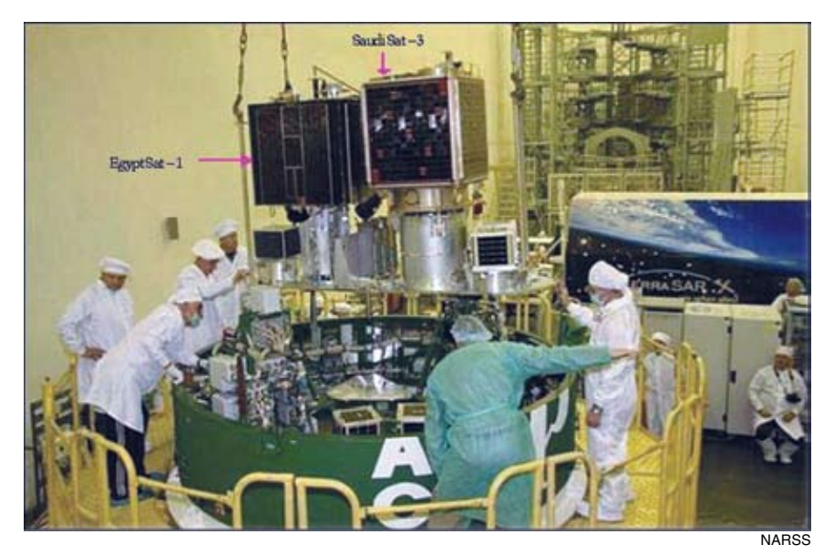
EgyptSat-1 being assembled in the nose cone of the Dnepr launcher, along with other payloads.

Things like deadlines. The planning of space takes a lot of planning: Every move is carefully planned and timed very accurately. The quality of the materials, the inadmissibility of error in processes. If you bring these concepts, and do these projects with the local industry, then you raise the standard of that industry significantly. And if you succeed in the final product, then, as I said, you get the certificate of quality to expand. If Egypt