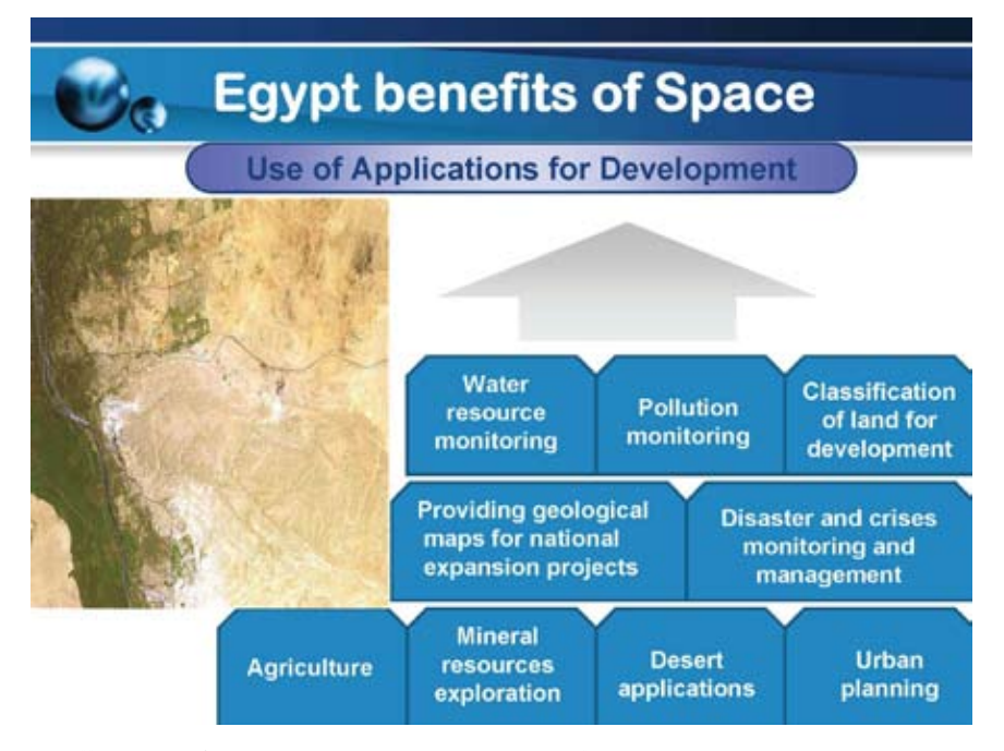
An illustration from Dr. Argoun's presentation to the Space Presentation Environment Conference in Cairo, May 2008.

try chooses that, and they get the benefit of the choice they make.